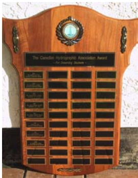
CHA Awards Plaque

The present fund investment that supports this award is performing very well and generating funds in excess of those required to finance the award of $2000.