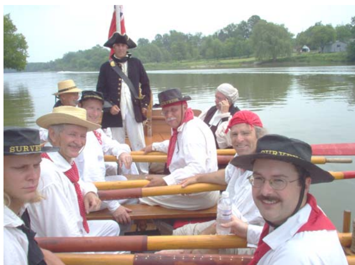
Surveyor’s Crew having a Grand Time on the Grand

Note the period plastic water bottle and cell phone; you just can’t seem to get away from these things, no matter where you are!