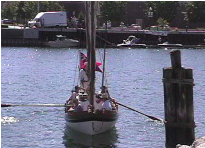
At Owen Sound

The launch then returned to Burlington to undergo her annual spring maintenance. Surveyor was then delivered to the Marine Heritage Association (MHA) by mid June. Due to circumstances beyond our control, the sail training group at Discovery Harbour did not make use of the Surveyor. The next event was a Hydrographic survey demonstration at the waterfront festival in Owen Sound, August 4.