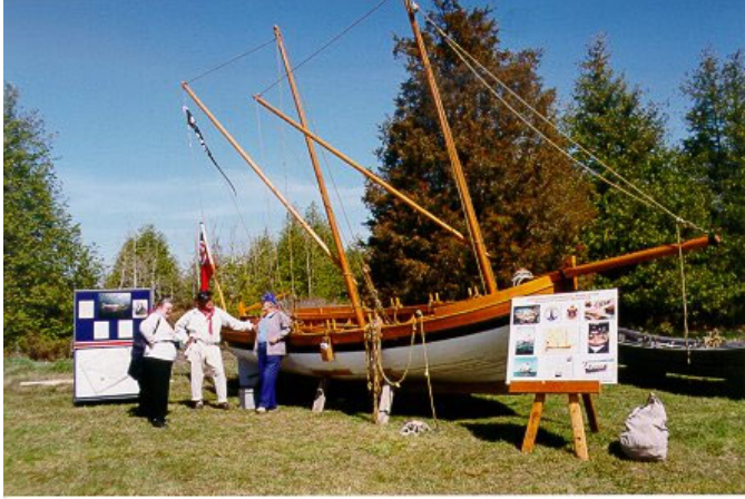
At Upper Canada Trade Faire

The 2001 season began with the Surveyor attending the Upper Canada Trade Faire in Odessa on April 28 & 29. This was a static display, which gave us the opportunity to explain the importance of the role of Hydrography in the early settlement of Canada.