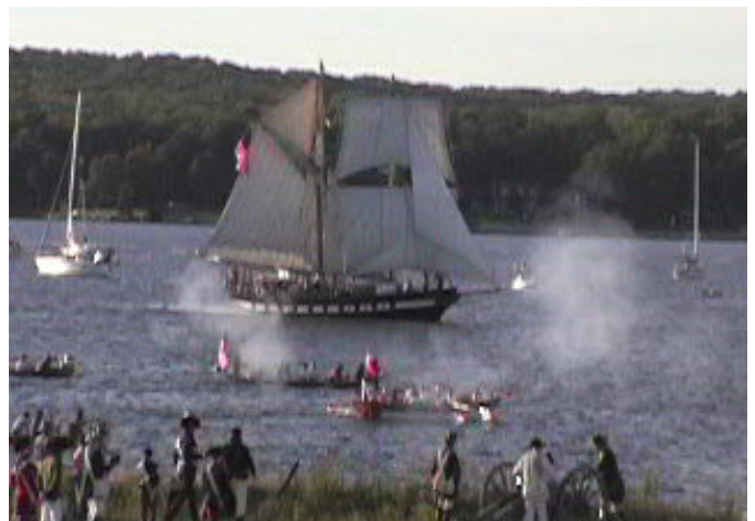
Under fire in Georgian Bay

The Surveyor is now back in Burlington for the winter and will be put in its new shelter.