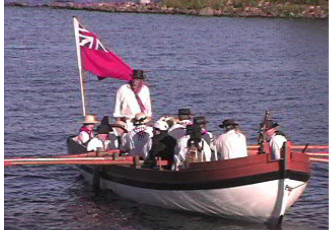
Battle of Georgian Bay

The last event of the year was the Faire of the Forks in Chatham, September 28 to 30