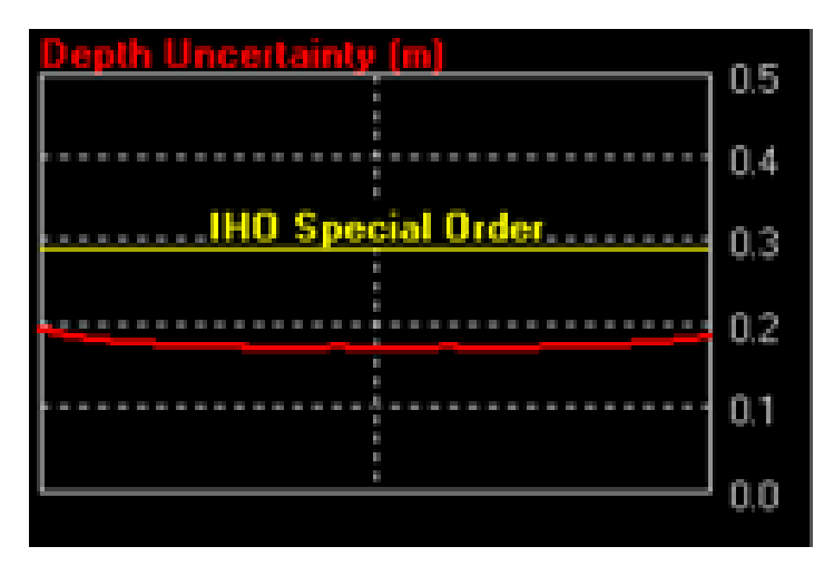
Figure 1: Depth uncertainty for the survey projects.

Figure 1 illustrates the TPU graph for the surveying projects. In the Graphs, the red horizontal line represents the estimated standard deviation computed according to IHO Special Order (in yellow).