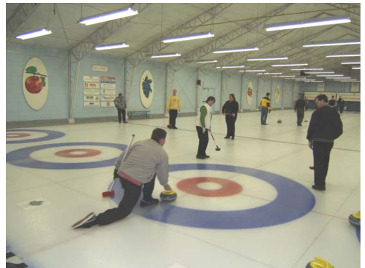
Delivering a Rock – Grimsby Curling Rink