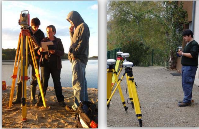
Figure 4: Land surveying works