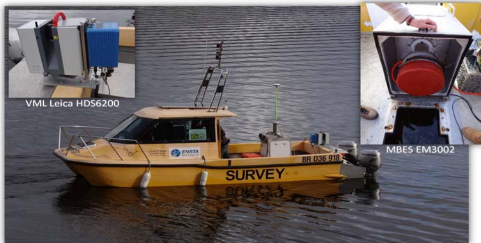
Figure 3: Topo-bathymetric works

To perform the topo-bathymetry surveys, the ENSTA Bretagne team had deployed their catamaran. The boat has a capacity of five persons on board including three workstations. One workstation was to control the sonar, the other for the VML and the last for the quality control in real-time. The boat was equipped with a MBES Kongsberg EM3002, from Boskalis, a VML Leica HDS6200 and a sidescan sonar (Figure 3). Mounted on a survey vessel, each component of the integrated system was coupled with an IMU (Ocatns 4 from IxSea). Robust geo-referencing and motion compensation enable the production of precise map of the lake from a combination of MBES and VML equipments.