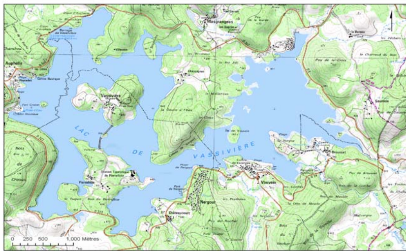
Figure 1: Localisation of Lake of Vassivière, France

The Lake of Vassivière is an artificial lake, located in the Creuse district, in the center of France (Figure 1). The lake has an area of 10 km 2 , with an average depth of 11 meters and a nominal volume of 110 millions cubic meters. Hydroelectric installations of Vassivière Lake are operated by EDF, Unité de Production Centre, by a hydraulic plant of 63,7MW. Hydroelectric facilities are located in the northwest part of the lake. A minimum flow of the Vienne River is used to cool down the Civaux nuclear power plant, located 200 km away from Vassivière. The touristic activities and navigation are managed by the Lake of Vassivière authorities. The creation of the dam in 1951 contributed to increase the tourism activity (coastal footpath and many nautical activities) in the area with an average visitor number of 70 000 persons per year.